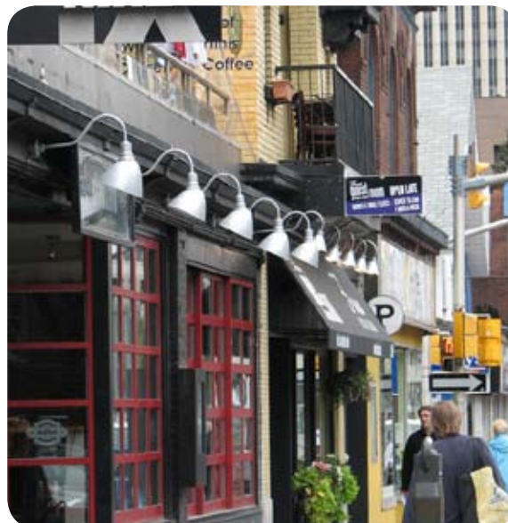
(Adam Gibbard, 2010)

The indicators below address both availability and accessibility of different types of food stores in your community. The Ottawa Neighbourhood Study (ONS) contains data about the location of food stores. You may also want to tour your neighbourhood to ensure that the ONS list is accurate, as stores frequently change. You may also choose to assess the types of foods that are sold in vending machines in community buildings.