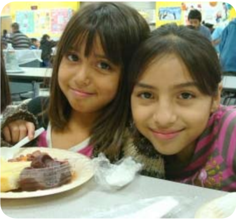
(Capital Food Bank of Texas)

Food insecurity has negative consequences on physical and mental health; it can also be socially isolating. People who are food insecure are less able to afford healthy foods like fruits and vegetables, dairy and meat products, and whole-grain products. Children and adults that experience hunger or are not eating a well-balanced diet are more likely to suffer poor health – including stomach aches and headaches, iron deficiency, obesity, and many other health problems. Food insecurity is also related to an increased likelihood of obesity, which can lead to many medical risks and complications, as well as a decreased quality of life. Food insecurity is also associated with increased stress, anxiety and depression.