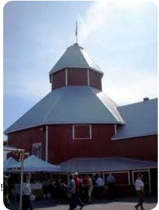
(Western Ottawa Community Resource Centre, 2010)

You don't need to be an expert to collect information in the community - everybody can do community-based research! Aside from gathering information, research can also help to build connections in your community.